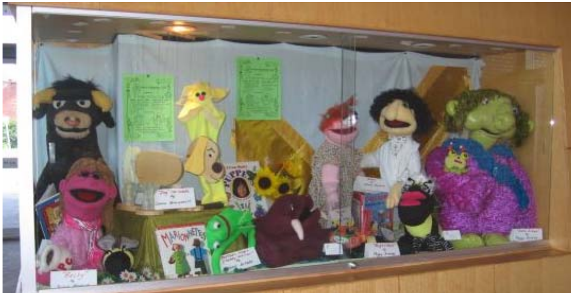
A puppet window display at St. Laurent Complex with puppets made by OPC members.

The Ottawa Puppetry Club, a member company of the OPA, has been busy preparing for their 9 th Annual Variety Show. This year's production was titled "A Twist of the Tale" and presented several fantasy stories through puppetry. Members have collaborated to build puppets, write scripts, make costumes and props, and rehearse their skits on their own time. Then, as a group, the Club met twice a month for full rehearsals of the 50-minute show. They did two performances on Sunday, April 27 th , at the St. Laurent Complex. A final performance took place May 2 nd as a fundraiser for Connaught Public School. For additional information about the OPC visit the web site at: http://www.webruler.com/artellephant/opc.html